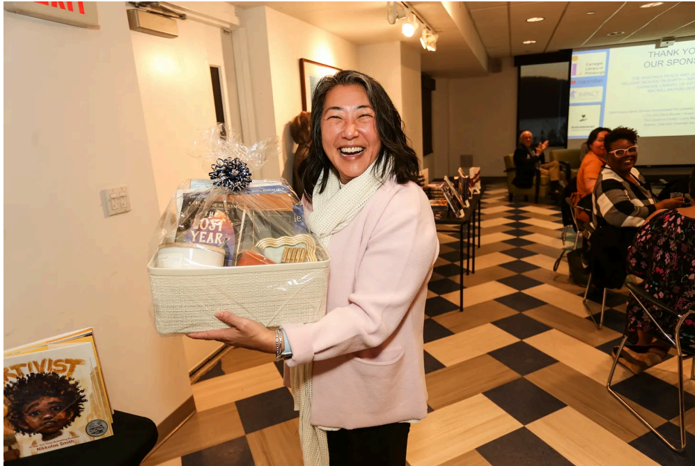
2024's raffle award winner (signed books prize)